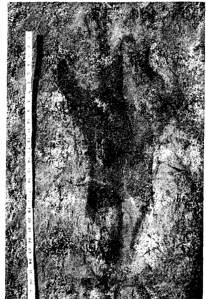
FIGURES 4 AND 5. Upriver of Taylor trail, facing west. In FIGURE 4, track +4 is in the lower portion, track +5 in the upper. Note anterior splaying on both and distinct coloration pattern on +4. FIGURE 5 is a close-up of track +4 under shallow water. Photographed in 1984 and 1985, respectively.