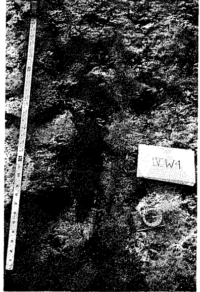
FIGURES 1 AND 2. Two parts of the IVW trail from the Alfred West site, photographed in 1983. Note the clear tridact pattern in FIGURE 1 and the more elongate, humanlike shape in FIGURE 2. Being in the same trail, these tracks were obviously made by the same dinosaur.